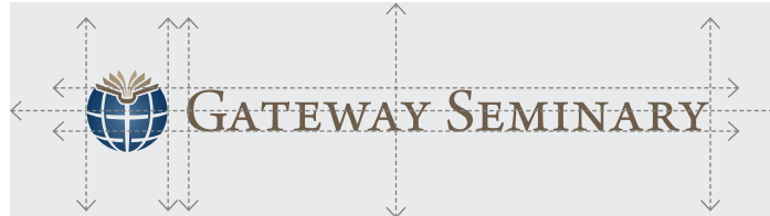
PRIMARY HORIZONTAL LOGO