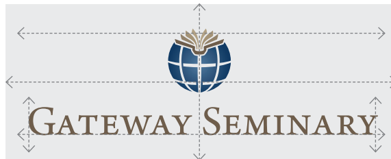
PRIMARY STACKED LOGO